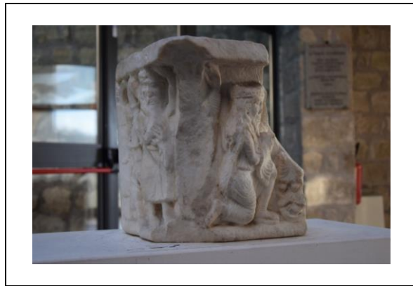
Figure 2. The capital of Magister Guilelmus in the Colle del Duomo Museum (Viterbo, Italy).