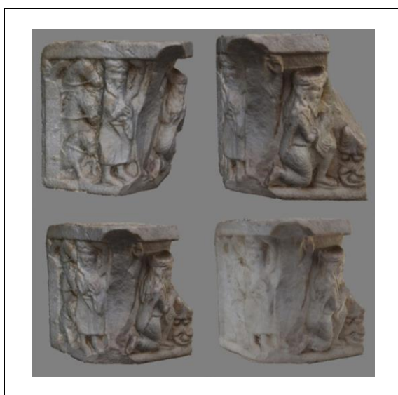
Figure 5. Visualization of the model 3D in the Agisoft PhotoScan® software, from different points of view.

The post-processing phase lasted about 4 hours by use a PC with the following characteristics: CPU Intel(R) Core(TM) i7-7700HQ CPU @2.8 GHz, Ram 16 Gb; Windows 10 64 bit, video card INVIDIA GeForce GTX 1050 4 Gb.