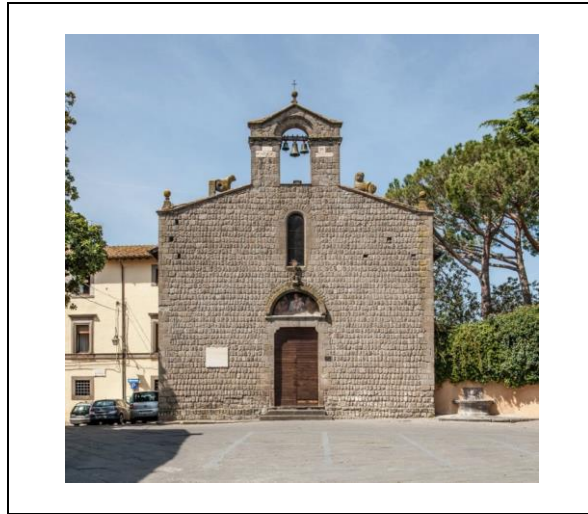
Figure 1. The church of Saint Silvestro in Piazza del Gesù (Viterbo, Italy).