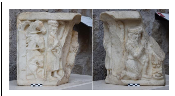
Figure 3. The left side and the front side of the capital with the scene of the Adoration of the Magi.