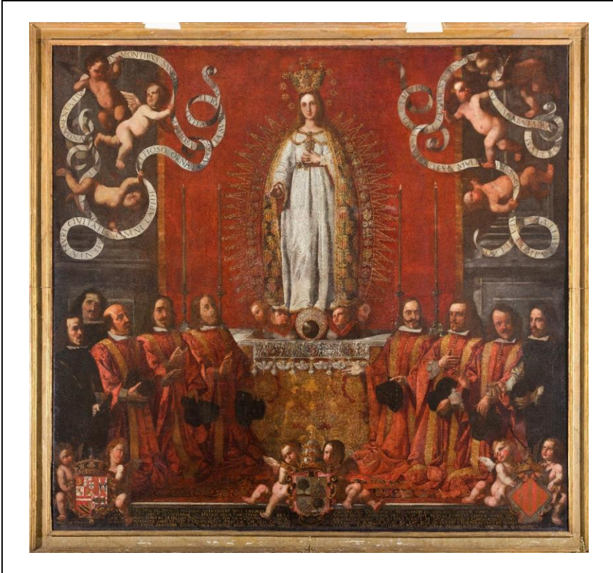
Figure 1. Jerónimo Jacinto de Espinosa, The Immaculate Conception with the Jurors of Valencia . 1662. Oil on canvas. Dimensions: 360 x 350 cm. Valencia, Museo Histórico Municipal.

Council) [AMV, Querns de Provisions, B-114 (1661-1662), s/f. 22 May 1662]. It must have been finished and delivered to the Casa de la Ciudad ('House of the City', the former City Hall) by mid-1663, since Espinosa received fifteen pounds on 8 June for some angels he had painted that did not appear in the original contract [AMV, Manuals de Consells, A-195 (1663-1664), fols. 24v-25r. 8 June 1663].